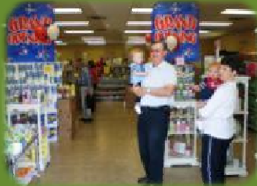
Inside glimpse of the new Buy-Rite Drugs building in Havana